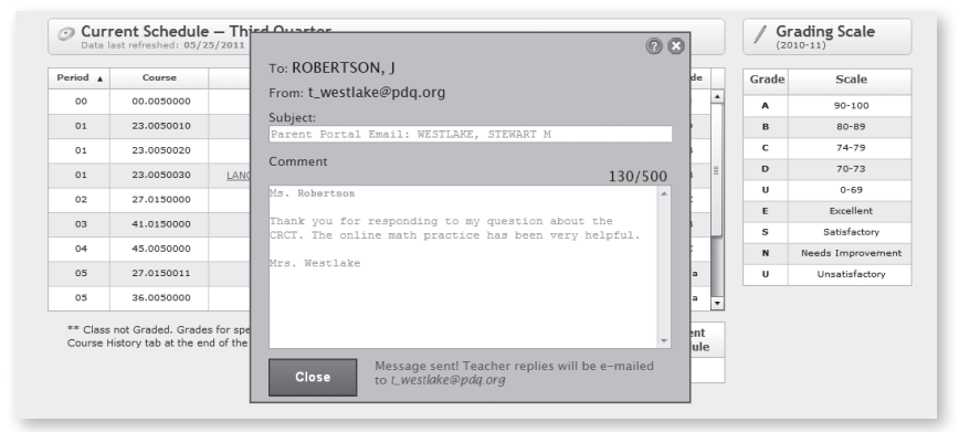
The e-mail window lets you know when the message has been sent.

go2.gwinnett.k12.ga.us an online resource for parents